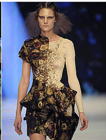
Alexander McQueen spring/summer 2010