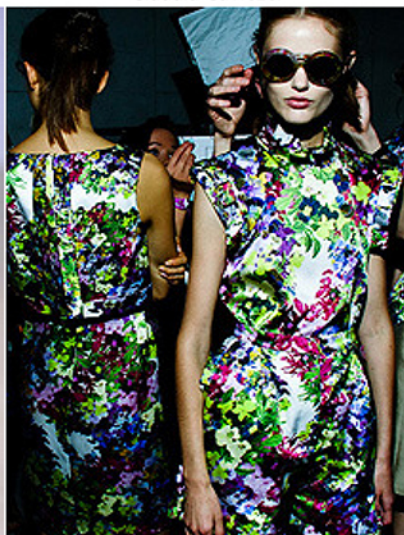
Erdem spring/summer 2010