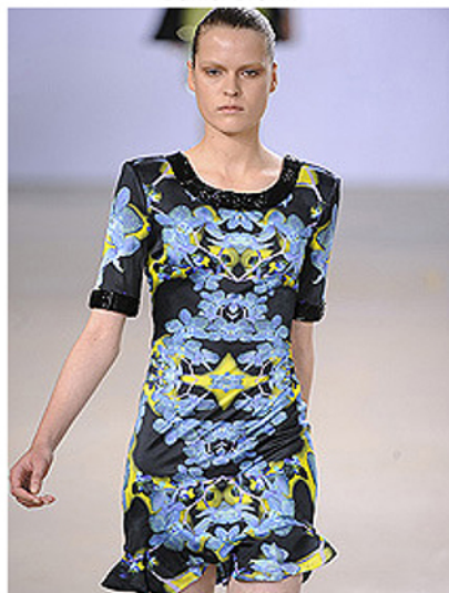
Matthew Williamson spring/summer 2010